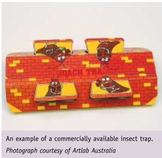
An example of a commercially available insect trap.

Pheromone traps are insect-specific, that is, a clothes moth trap will attract only clothes moths.