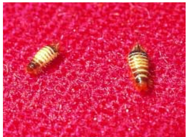
Carpet beetle larvae.