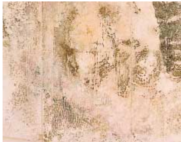
This mould colony appeared as thick multicoloured lumps.

Most people at one time or another have seen mould growing on old bread, cheese, jam, damp wood or leather. This growth, usually appearing as a fine, fluffy mass on the surface of such materials, is called the mould colony.