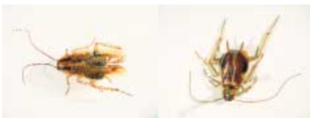
German cockroach (left) and Brown Banded cockroach (right).

Attack: Cockroaches eat just about anything, including leather, hair, skins, paper and books.