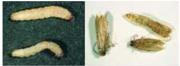
Common Clothes moth— Tineola bisselliella —larvae (left) and adults with laval case (right).

Description: Common clothes moths are 8–10mm long and are white to silver-buff in colour. The larvae are up to 12mm long and can be found amongst a network of silken tubing.