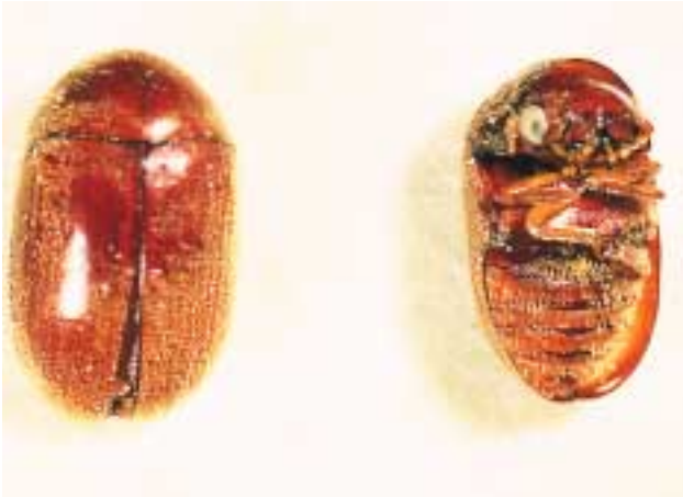
Cigarette beetle— Lasioderma Serricorne .