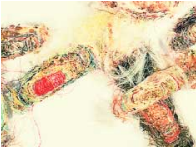
Cases of a Casemaking clothes moth— Tinea Pellionella —found in an Aboriginal feathered bag.