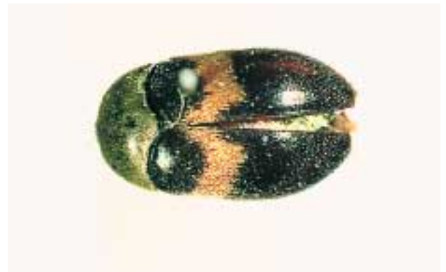
Carpet beetle - Attagenus Fasciculatus .

Description: There are several species which will attack museum and library collections. The adults are up to 5mm in length and are oval or elongated oval in shape. They vary in colour, depending upon the species, and can be black, white, brown, mottled or variable. The larvae vary in size, depending on the species; they are very active, and usually brown in colour. All are covered with bristles. The only evidence usually found of this beetle's presence is cast-off skins of the larvae and pupae.