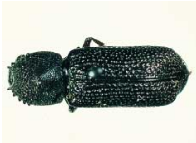
Large Auger beetle— Bostrychopsis Jusuita .

Description: Most of the borers in this group will not re-infest the wood once it has dried out. One exception is the Auger beetle, which can continue to re-infest the wood as long as the moisture content is above 20 per cent. This group also includes such borers as the wood wasps, Longicorn and Jewel beetles.